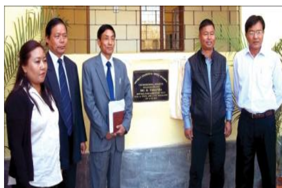
Shri. R. Tohanba Hon'ble Parliamentary Secretary Eco. & Stats and IPR inaugurating District Statistical Office building, Dimapur